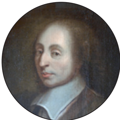
At 19 ... BLAISE PASCAL invented the calculator