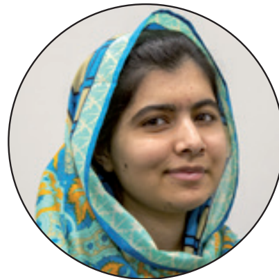
At 17 ... MALALA YOUSAFZAI won the Nobel Peace Prize