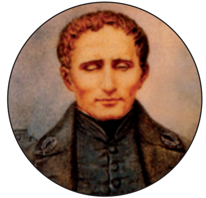
At 15 ... LOUIS BRAILLE invented the Braille system