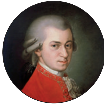
At 14 ... WOLFGANG AMADEUS MOZART composed his first opera