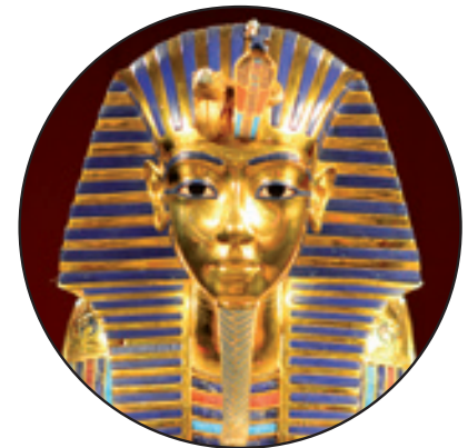
At 18 ... TUTANKHAMEN died after being on the throne of Egypt for six years