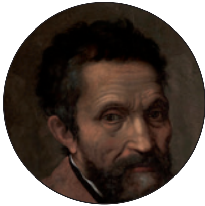
At 13 ... MICHELANGELO had left school and begun the first of his paintings

Young people are usually full of plans, ambitions, and energy. They can achieve many things older adults can't. Sometimes it's just because adults are too busy and/or tired or don't dare. Here's a list of things famous people did in their teen years.